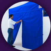
Canopy Wall w/Zipper