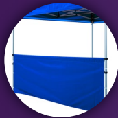
Canopy Rail Skirt